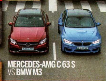
MERCEDES-AMG C 63 S VS BMW M3

AFRICA TWIN VS MULTISTRADA VS TIGER 800 VS TIGER EXPLORER