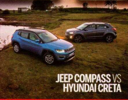
JEEP COMPASS VS HYUNDAI CRETA