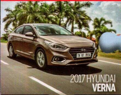
2017 HYUNDAI VERNA

EXCLUSIVE LEVELS OF PERFORMANCE HURACAN VS POLO GTI VS S60 POLESTAR