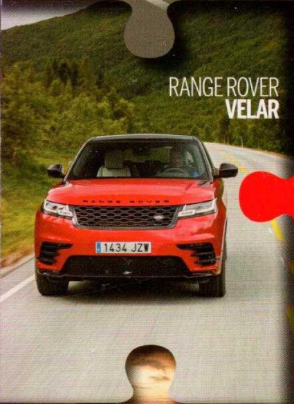
RANGE ROVER VELAR